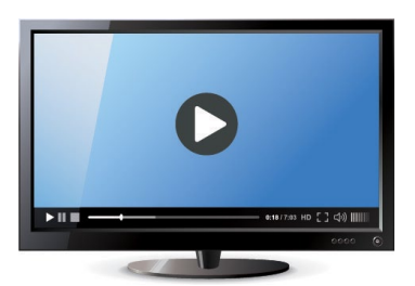
Click Here to Watch DarrasLaw TV Channel

Protect your family and your colleagues by understanding the role alcohol plays in holiday accidents. Judgment can be impaired by just one drink so plan your outings accordingly. Make sure to do all your holiday preparation before consuming alcoholic beverages to avoid unnecessary injuries. If you attend a company party or plan to drive, limit your consumption and make transportation arrangements in advance.